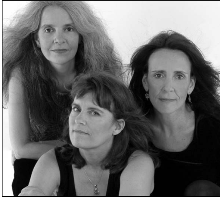
The Roches

In the nineties they expanded to pursue solo projects. As a duo, Maggie and Suzy created "Zero Church." Their widely acclaimed collection of prayers, which began at Harvard University, is a musical celebration of faith and diversity, and was featured on NPR's All Things Considered.